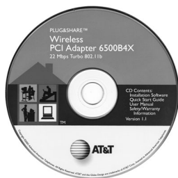
CD-ROM Contains installation software, User Manual, Quick Start Guide and Safety & Warranty Information.