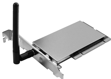
Plug&Share™ Wireless PCI Adapter 22Mbps Turbo 802.11b